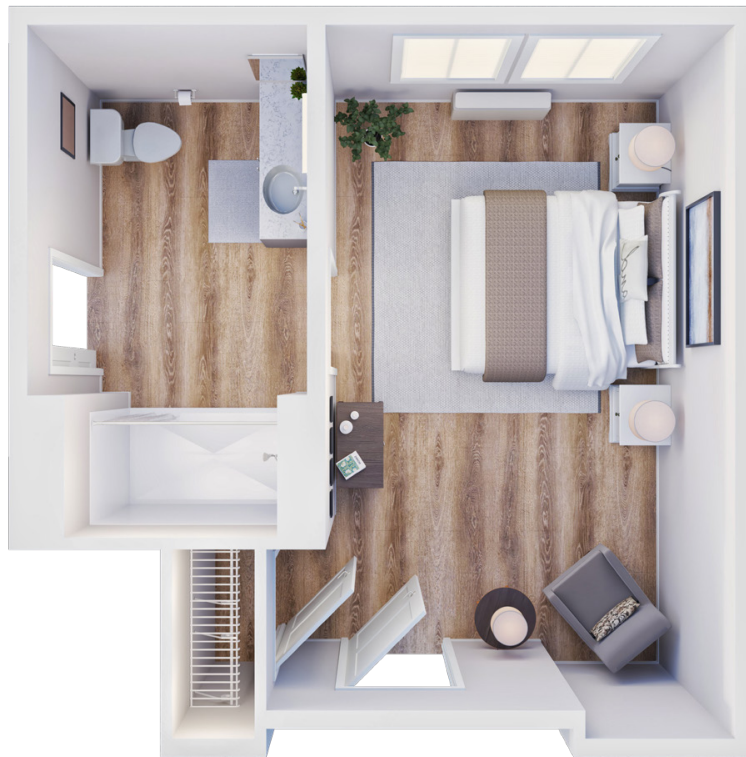
APPROXIMATE SQUARE FOOTAGE