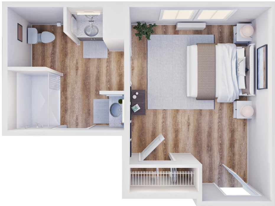
APPROXIMATE SQUARE FOOTAGE