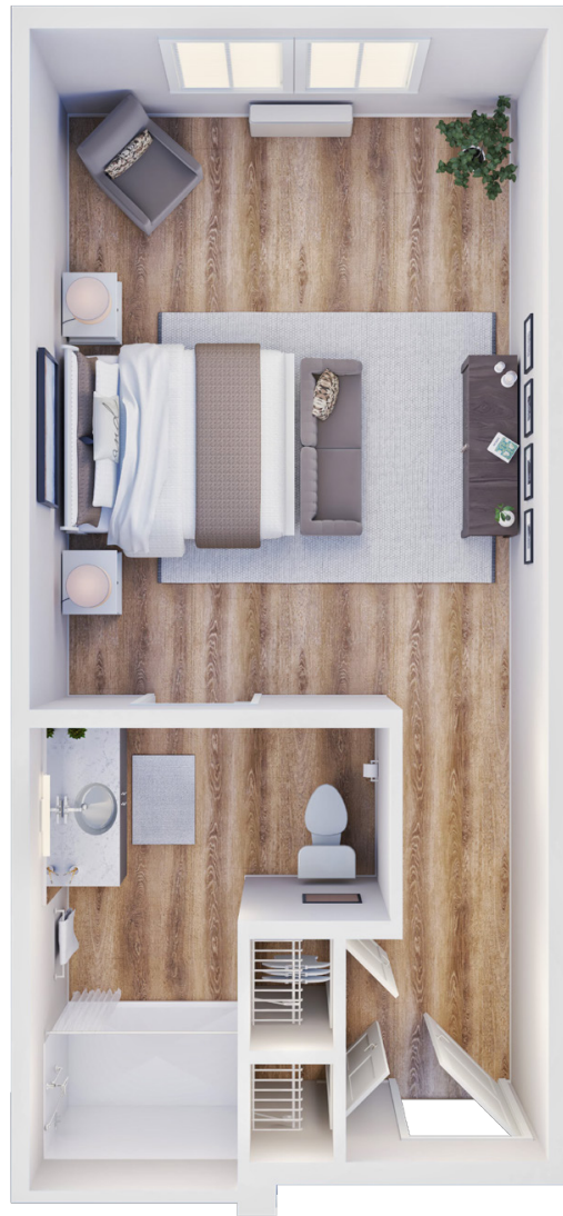
APPROXIMATE SQUARE FOOTAGE